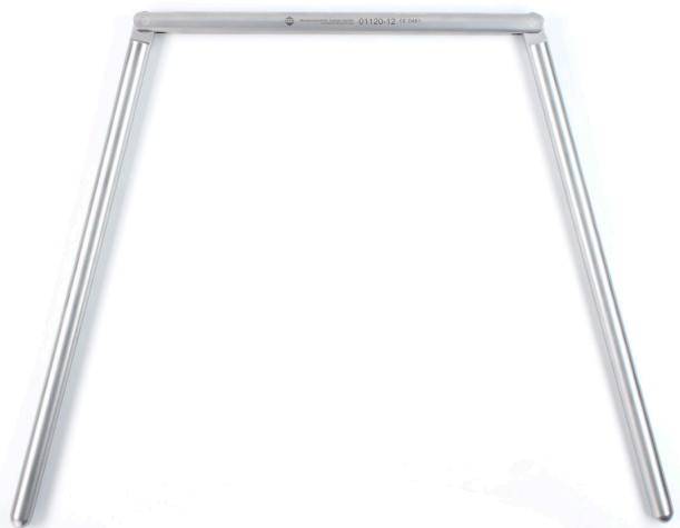
01120-12 Cross bar Rochard, collapsible (2 hinges)