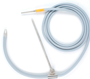
03FE000273 Flexible cold light cable, Ø 4,5/4,8 x 2650 mm with post