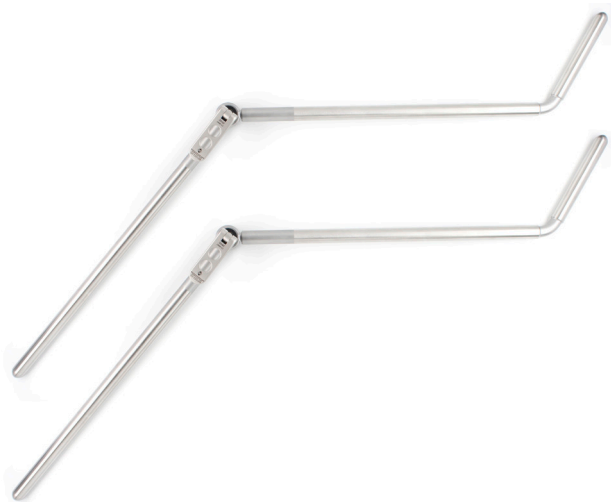
01120-29 Frame arm (couple) for retractor blades, with joint, collapsible, for Rochard