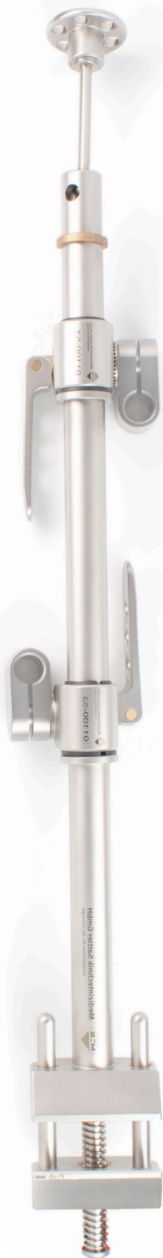
01100-63 Sterile field post with 2 clamps 20/14mm