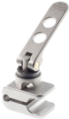
01130-05 Quick - release clamp for holder 14/8 mm