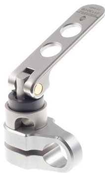
01130-06 Quick - release clamp for holder 14/8 mm