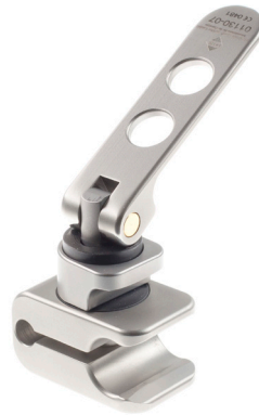
01130-07 Quick - release clamp for holder 14/8 mm